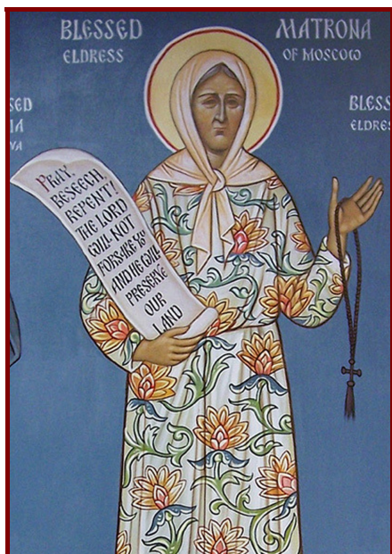
St. Matrona, central figure of narthex wall icon, St. Innocent Orthodox Church, Redford, MI

Feast Day: May 2 nd † Glorified: 1999 & 2004